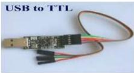
Cable USB to TTL

USB to TTL is used for the serial communication between microcontroller and computer system. We can't connect directly microcontroller and computer system. Inside the big USB plug is a USB<->Serial conversion chip and at the end of the 36" cable are four wire - red power, black ground, white RX into USB port, and green TX out of the USB port.