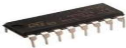
Fig: - L293D Motor Driver

Motor are can't connect directly to the microcontroller, for that we are use L293D motor driver. L293D is a typical Motor driver or Motor Driver IC which allows DC motor to drive on either direction. L293D is a 16 -pin IC which can control a set of two DC motors simultaneously in any direction. It means that you can control two DC motor with a single L293D IC, Dual H-bridge Motor Driver integrated circuit (IC). The L293D can drive small and quiet big motors as well.