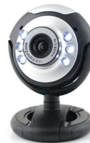
Fig 2. Camera

Camera: - The camera is acts as a digital eye for input to computer system. It is used to give the input to computer system as the snapshot of note.