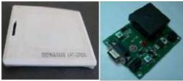
Fig 3. RFID Tag & Reader

RFID Security: - it provides a unique identifier for that object. And, just as a bar code must be scanned to get the information, the RFID device must be scanned to retrieve the identifying information. Radio-Frequency Identification (RFID) is the use of radio waves to read and capture information stored on a tag attached to an object. A tag can be read from up to several feet away and does not need to be within direct line-of-sight of the reader to be tracked.